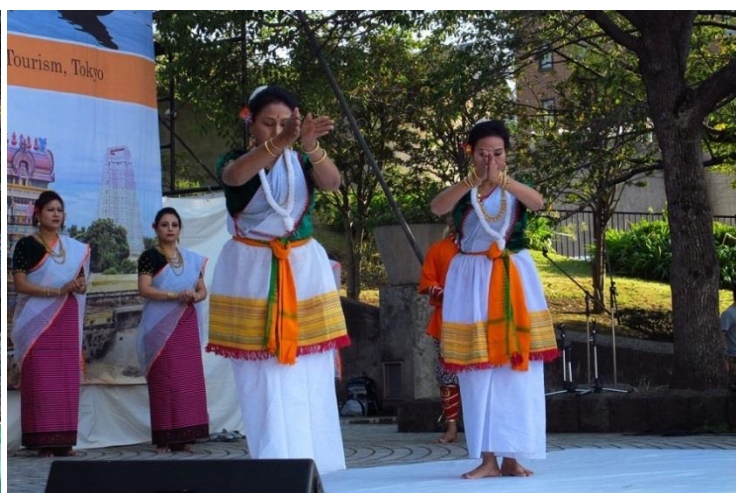
Manipuri Dance Troupe at Diwali Mela Yokohama