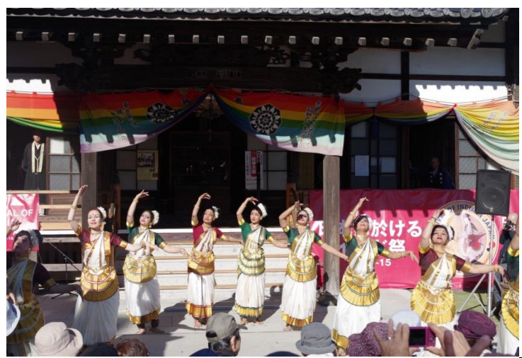
Mohiniyattam Dance Troupe at Koonji Autumn Festival