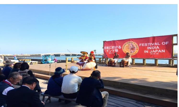
Kuttiyattam Dance Troupe at Maple Kan Miyagi