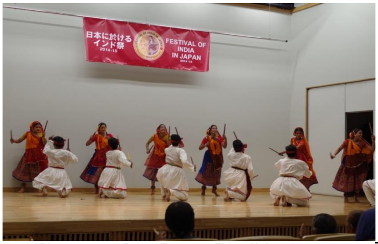
Bharatanatyam Dance Troupe at Ehime University