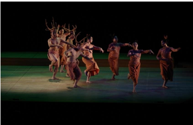
Manipuri Dance Troupe at Izumity Hall Sendai