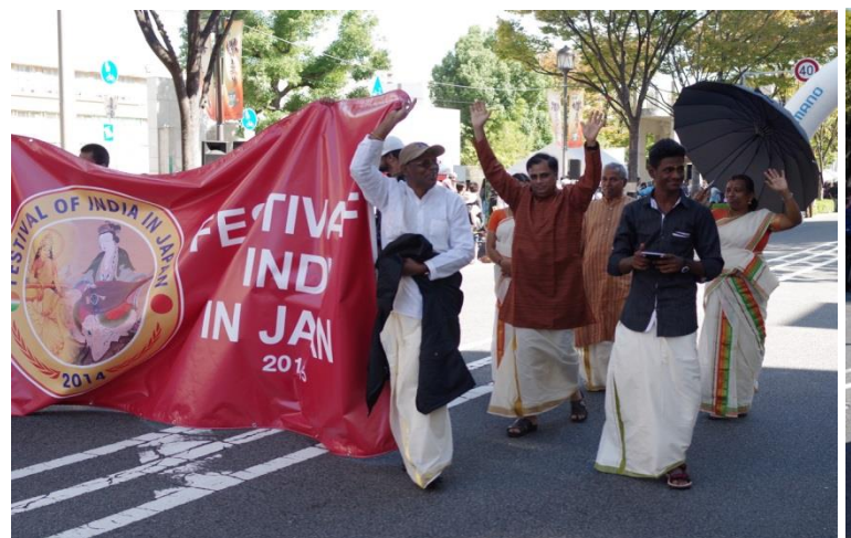
Kuttiyattam Dance Troupe at Sakai Festival