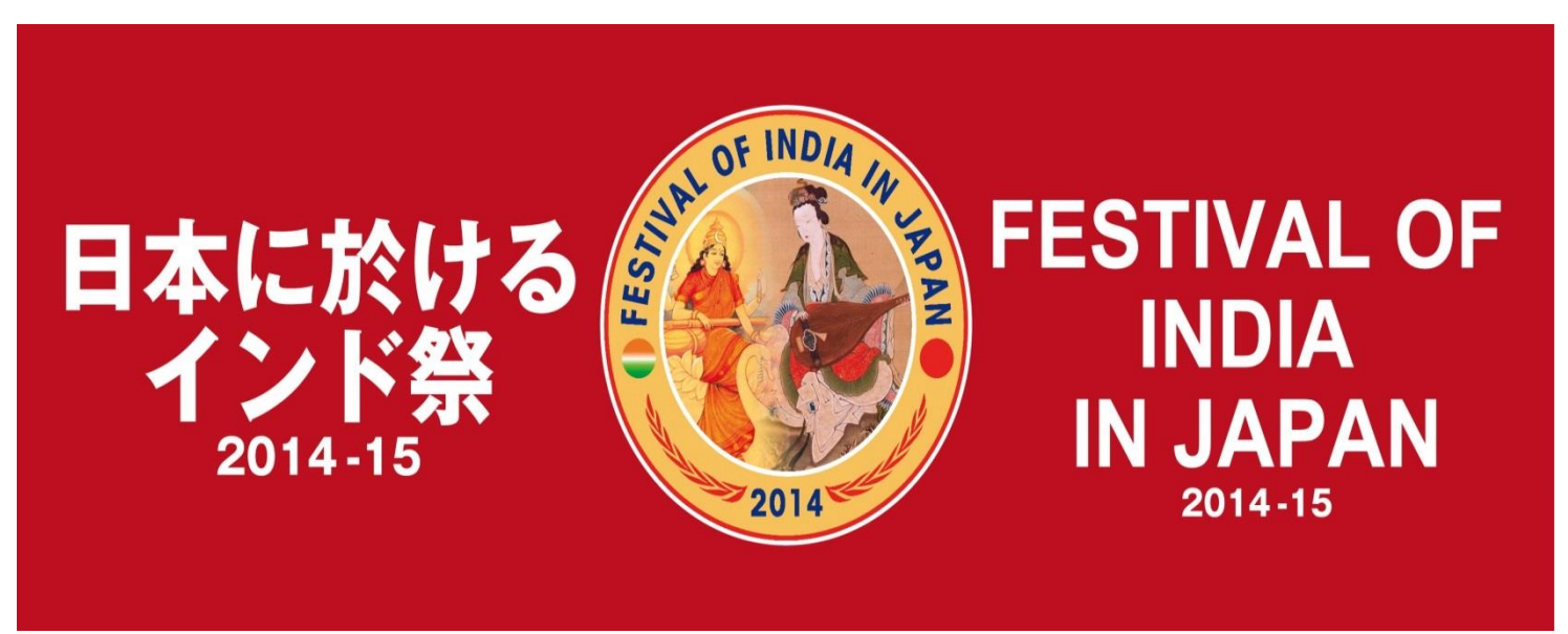
Banner of the Festival of India in Japan 2014-15

The Ministry of Culture has decided to organize "Festival of India in Japan 2014-15". This was announced during the visit of Prime Minister, HE Mr. Narendra Modi to Japan from 30 August to 3 September 2014. Programmes planned during the Festival of India in Japan 2014-15 include Dance Festival, Exhibition of Indian Buddhist Sculpture in Tokyo National Museum from 17 March to 17 May 2015, Symposium on Buddhist Manuscripts on 26-27 November 2014, Buddhist Chanting for peace in Fukushima and Hiroshima from 3 to 8 November, Literary Festival, Film Festival and Food Festival. While the Festival of India in Japan was started with Bhartnatyam on 4 October 2014, it was formally launched by Shri Shripad Yesso Naik, Honorable Minister for Culture and Tourism and Mr. Akihiro Ohta, Minister of Land, Infrastructure, Transport and Tourism of Japan on 27 October 2014.