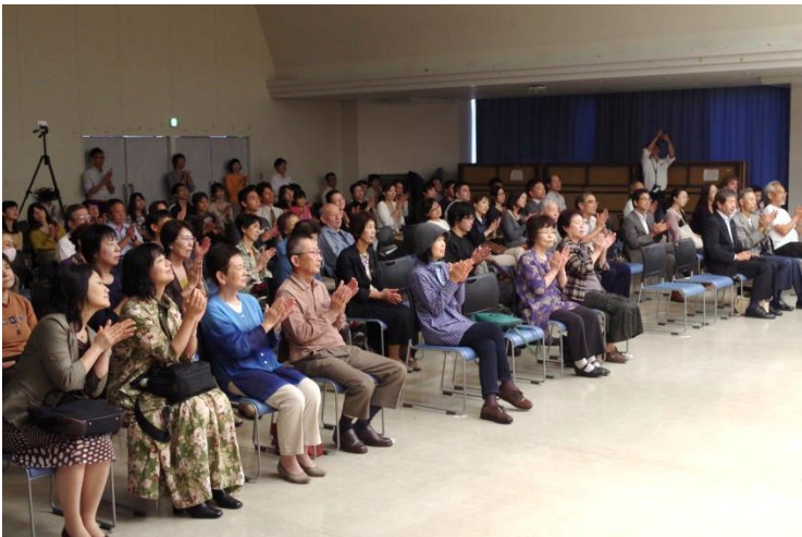
Bharatanatyam Dance Troupe at Shimane University