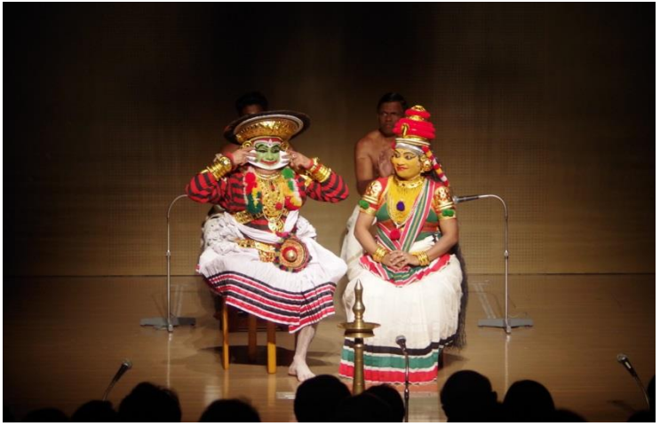
Kuttiyattam Dance Troupe at Niigata Prefecture