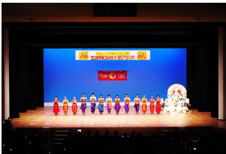
Bharatanatyam Dance Troupe at Durga Puja Diwali Festival