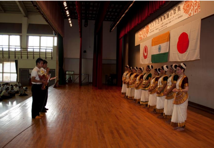
Mohiniyattam Dance Troupe at Okinawa Chinan High school