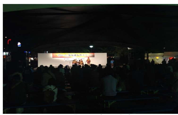
Kuttiyattam Dance Troupe at Gumma Prefecture