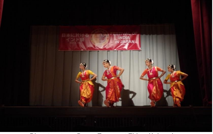
Bharatanatyam Dance Troupe at Ehime University