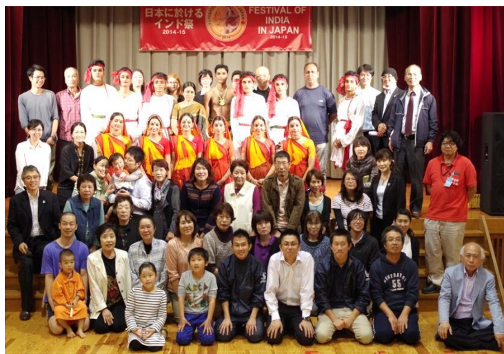
Bharatanatyam Dance Troupe in Shimane Prefecture