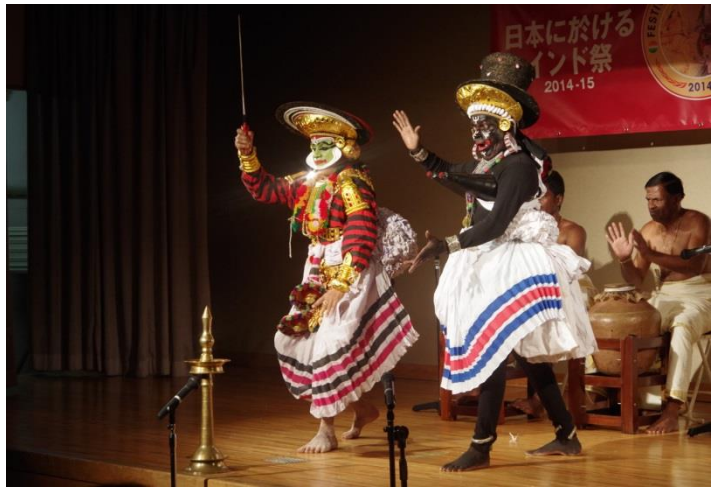
Kuttiyattam Dance Troupe at Tsukioka