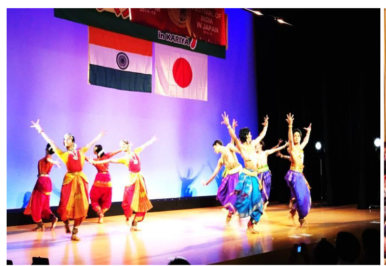
Bharatanatyam Dance Troupe in Kariya City