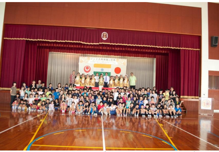
Mohiniyattam Dance Troupe at Okinawa Nakadomari Middle School