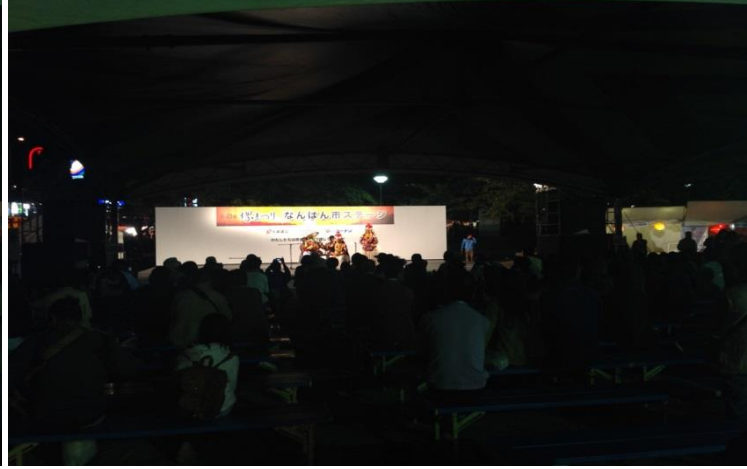
Kuttiyattam Dance Troupe at Gumma Prefecture