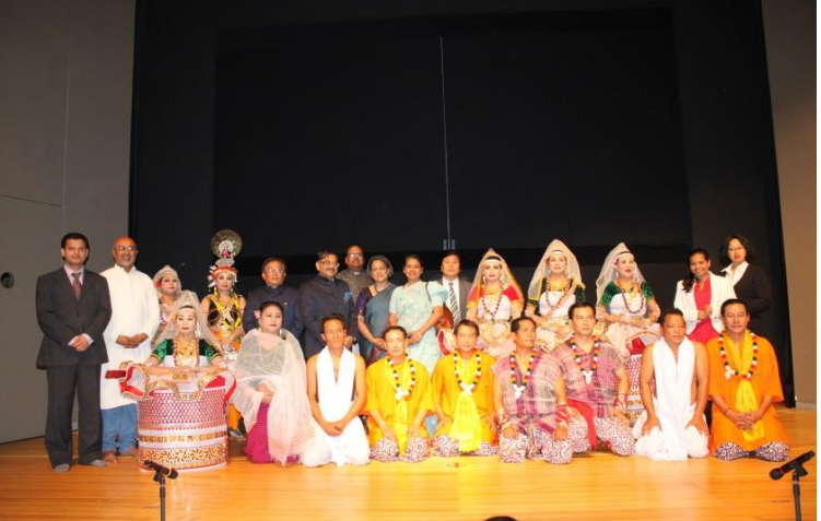
Manipuri Dance Troupe at Vivekananda Cultural Centre Tokyo