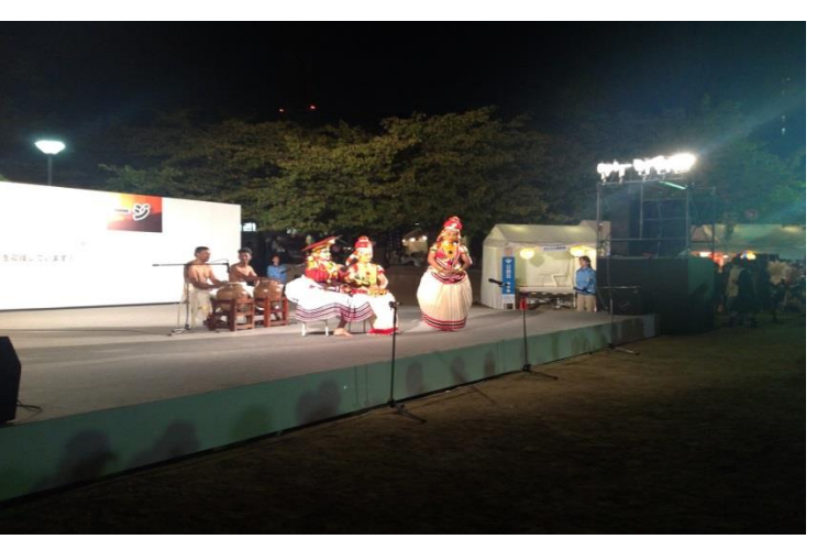
Kuttiyattam Dance Troupe at Sakai City Festival