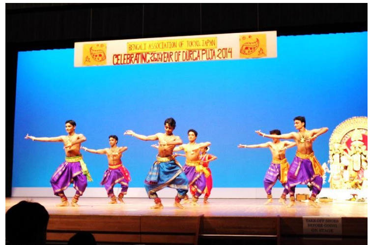
Bharatanatyam Dance Troupe at Durga Puja Diwali Festival