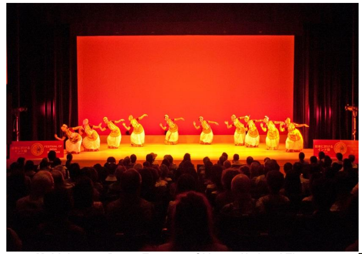
Mohiniyattam Dance Troupe at Okinawa National Theater