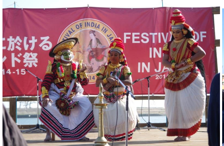
Kuttiyattam Dance Troupe at Maple Kan Miyagi