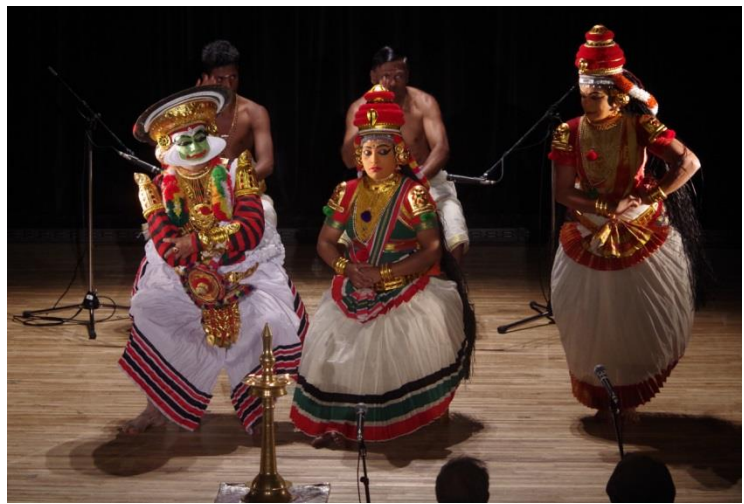
Kuttiyattam Dance Troupe at Niigata Prefecture