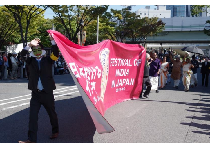
Kuttiyattam Dance Troupe at Sakai Festival