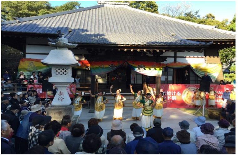
Mohiniyattam Dance Troupe at Koonji Autumn Festival