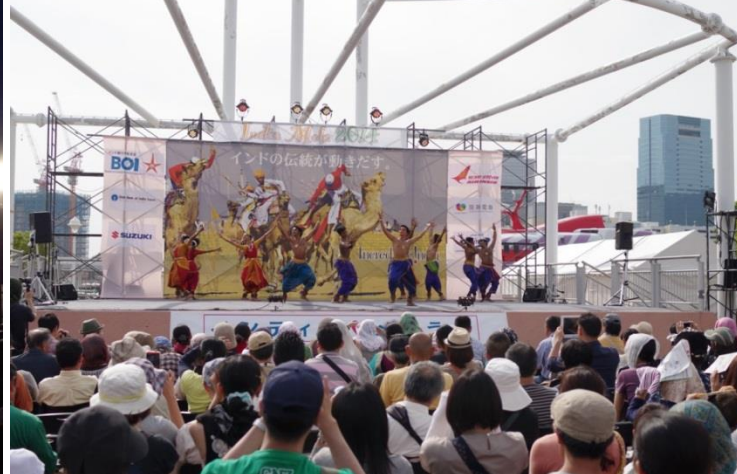
Bharatanatyam Dance Troupe at India Mela Kobe