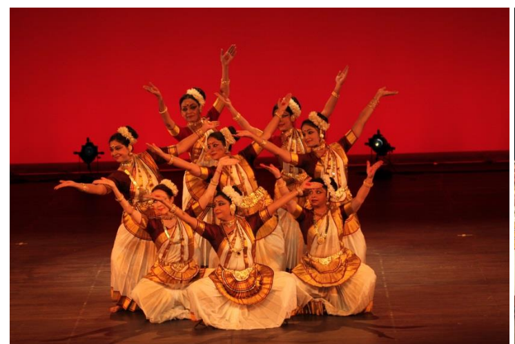
Mohiniyattam Dance Troupe at Launch of FOI