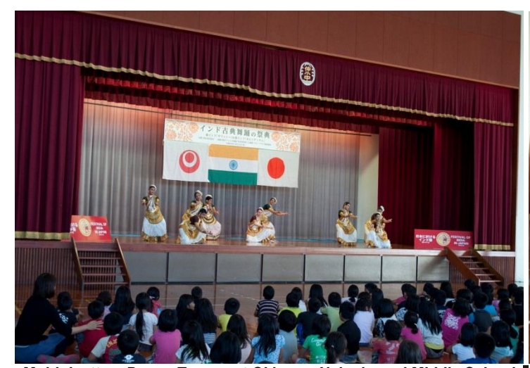
Mohiniyattam Dance Troupe at Okinawa Nakadomari Middle School