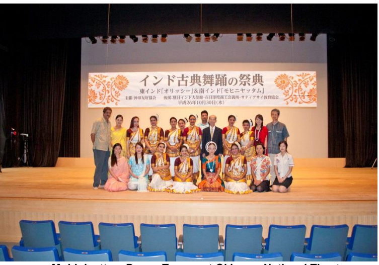
Mohiniyattam Dance Troupe at Okinawa National Theater