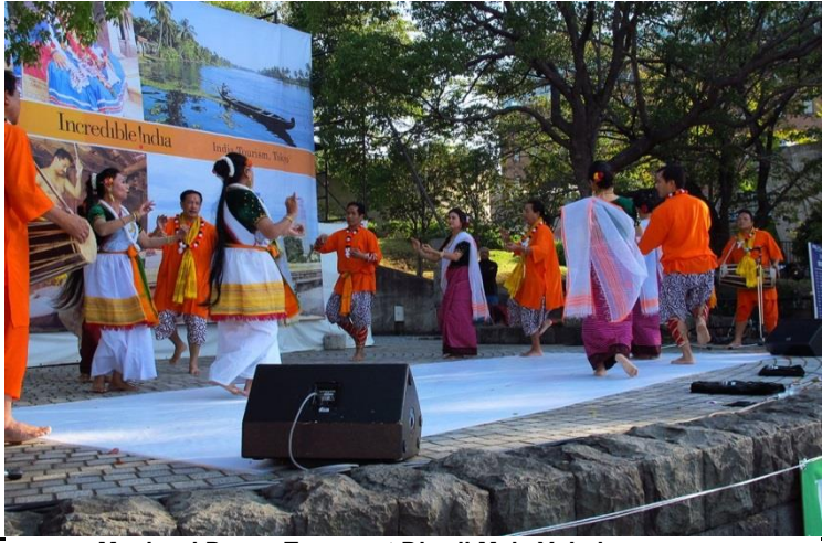
Manipuri Dance Troupe at Diwali Mela Yokohama