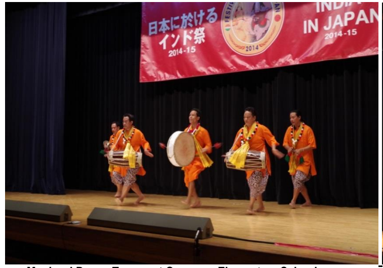
Manipuri Dance Troupe at Onagawa Elementary School