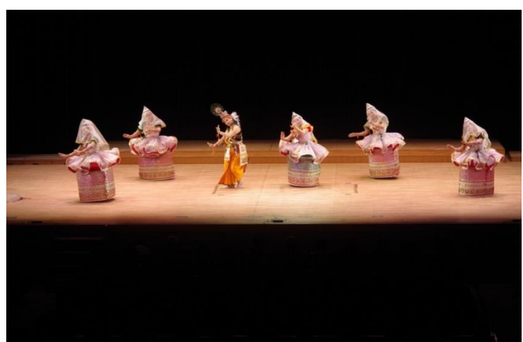
Manipuri Dance Troupe at Izumity Hall in Sendai