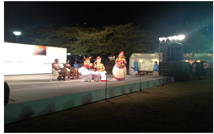
Kuttiyattam Dance Troupe at Sakai City Festival