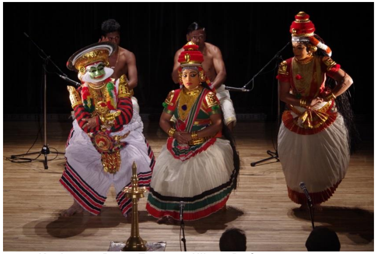
Kuttiyattam Dance Troupe at Niigata Prefecture