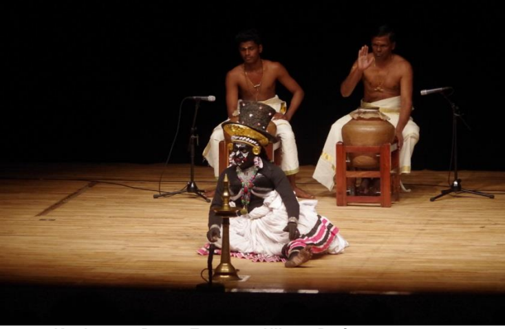
Kuttiyattam Dance Troupe at Niigata Prefecture