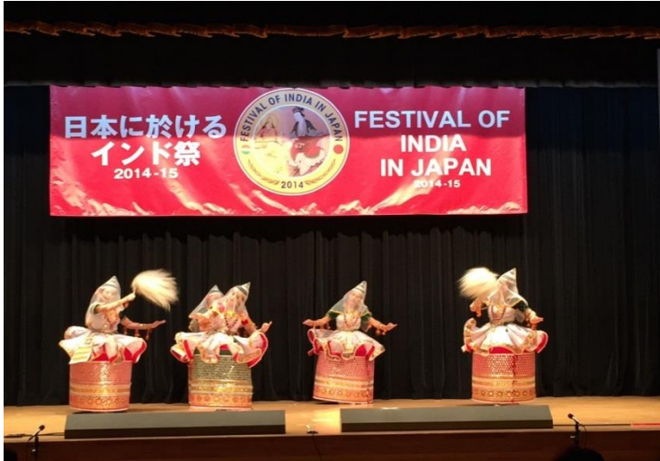
Manipuri Dance Troupe at Onagawa Elementary School