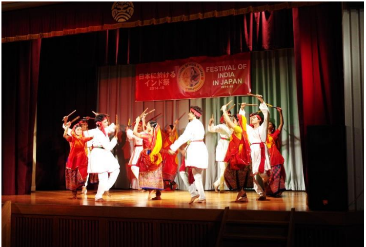
Bharatanatyam Dance Troupe in Shimane Prefecture