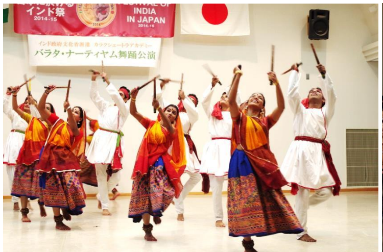
Bharatanatyam Dance Troupe at Shimane University