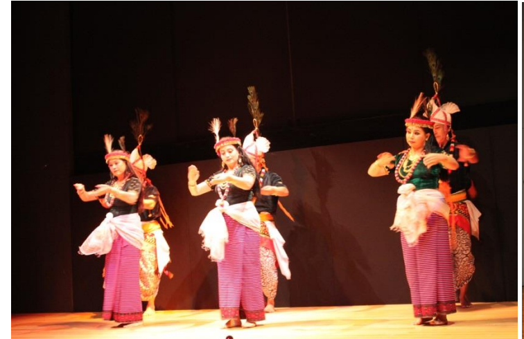
Manipuri Dance Troupe at Vivekananda Cultural Centre Tokyo