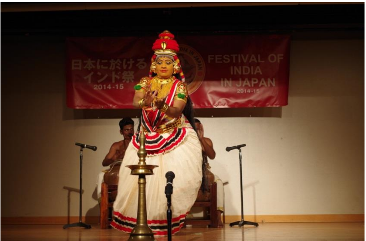
Kuttiyattam Dance Troupe at Tsukioka